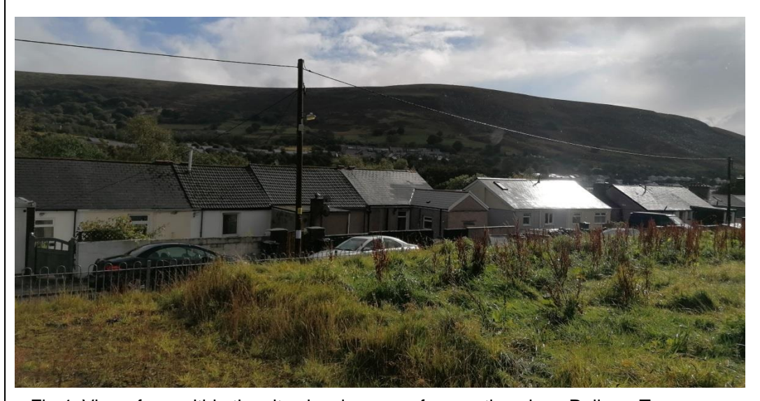
Fig 4. Views from within the site showing rear of properties along Railway Terrace.