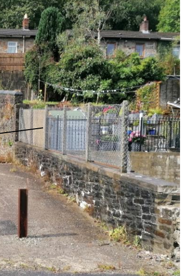
Fig 6 (Right): Existing boundary treatments to northern boundary.