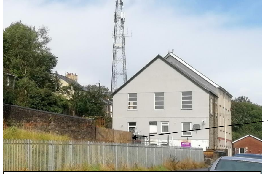
Fig 5 (above): 1 & 2 Ebenezer Cottages at northern end of site. Please note top row of windows are non-residential.

Fig 6 (Right): Existing boundary treatments to northern boundary.