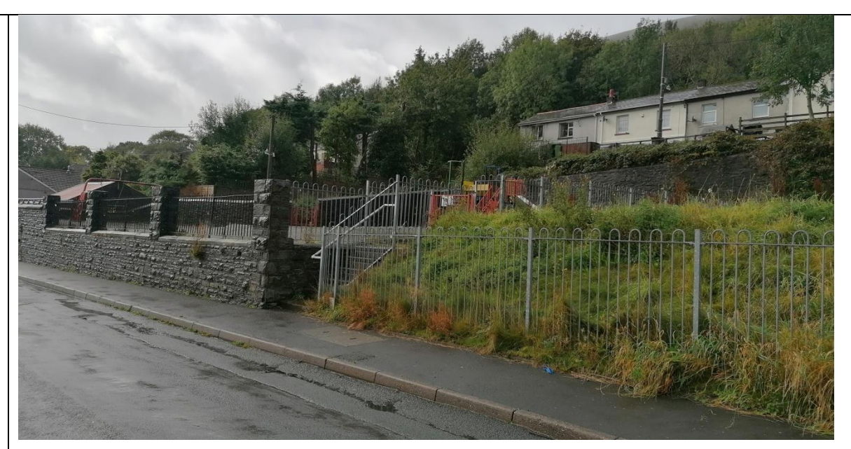
Fig 2. Southern end of the site (within galvanised railings) and adjacent playground (stone boundary)