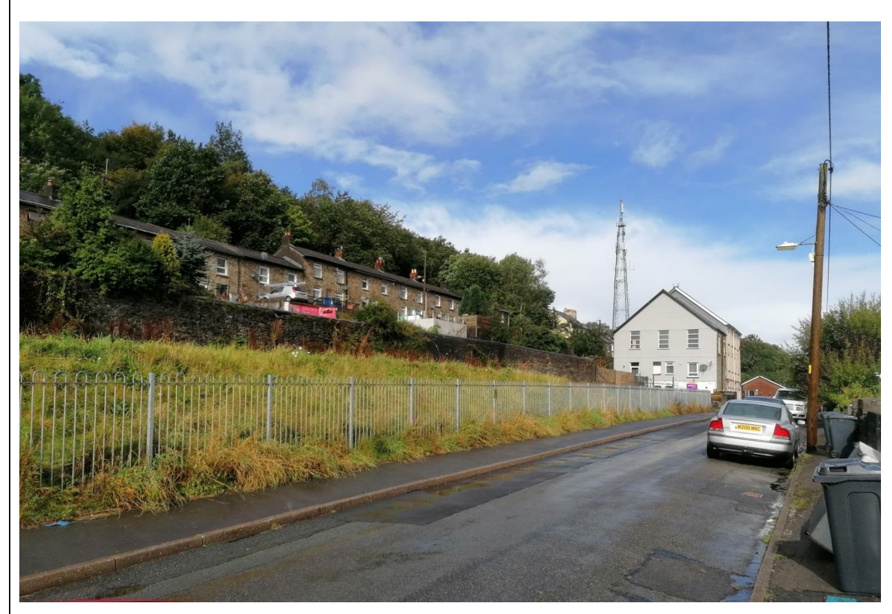
Fig 1. View of the site looking northwards